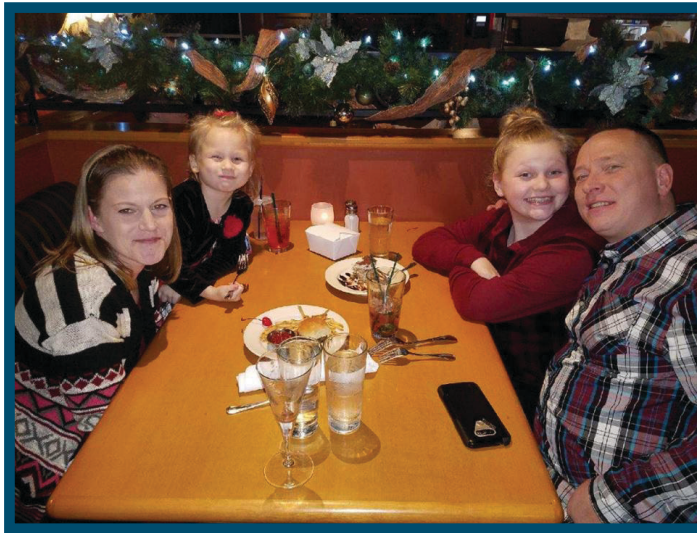
A Housing Hope family enjoys their time at Lombardi's

A HEARTFELT THANK YOU to Lombardi's Everett for supporting Housing Hope families during their Dine for Hope campaign in December. Throughout the campaign, 50 Housing Hope families enjoyed meals out at Lombardi's absolutely free. Additionally, Village Theatre donated theater tickets. Thank you so much for making the holidays so bright for these families!