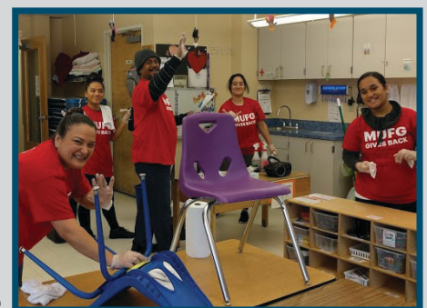
Union Bank Volunteers at Tomorrow's Hope

At Housing Hope, we treasure your gifts of time and talent, and feel that our volunteers have a huge impact on our mission. For more information about volunteering with Housing Hope, visit housinghope.org/volunteer-your-time and fill out an application.