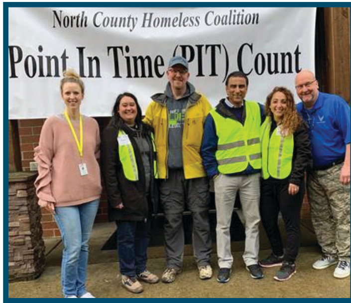
Volunteers from Bank of America

THE POINT IN TIME COUNT is an annual outreach effort to count and survey our homeless neighbors in an effort to provide as much community support as possible. This year's count was held on January 19, with 60 staff and volunteers helping, including many volunteers from Bank of America and Boeing. Free meals and laundry were available for homeless neighbors at Suds n Duds Laundromat in Smokey Point. Thank you volunteers!