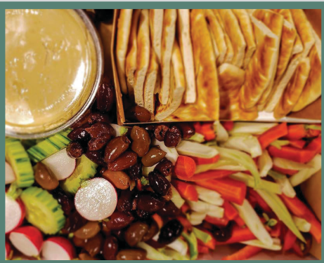
Greek Salad Platter

CafeWorks isn't the only birthday around here! HopeWorks leadership, celebrating the organization's 8th birthday