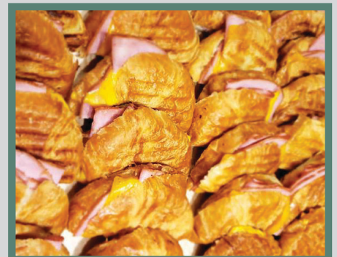
Breakfast Sandwich Platter